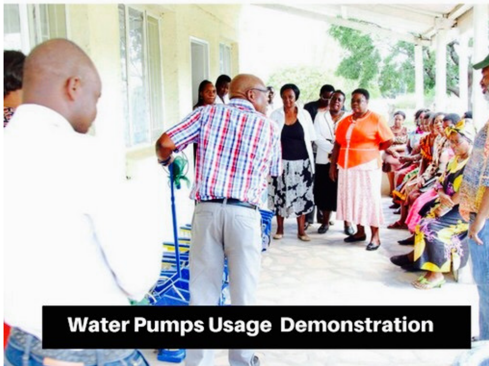
Water Pumps Usage Demonstration