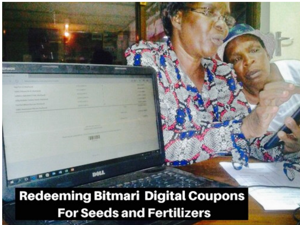
Redeeming Bitmari Digital Coupons For Seeds and Fertilizers